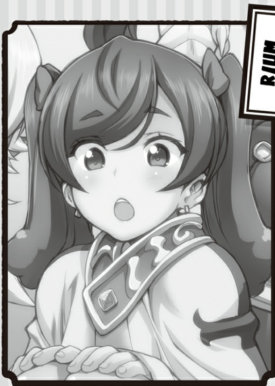
HARUNO'S PARTY MEMBER. A CRYSTAL MAGE.