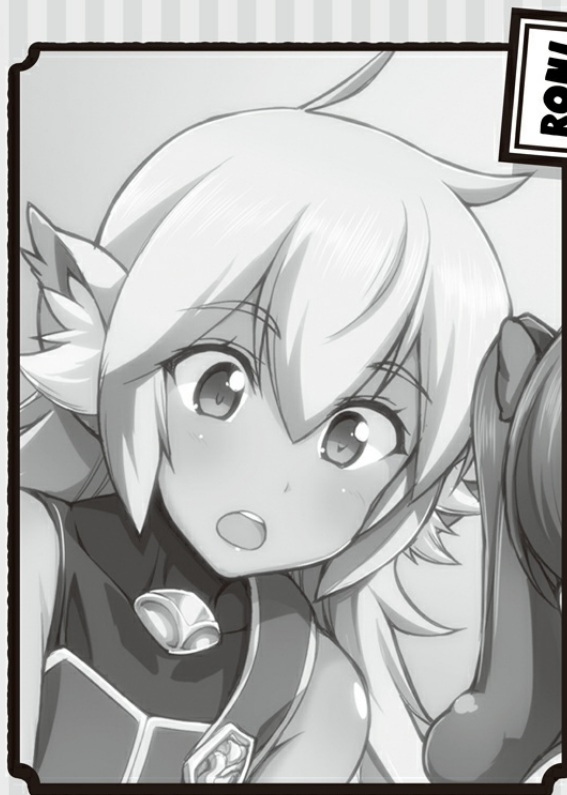
CLENA'S ATTENDANT. A LYCAON, A WOLF DEMI-HUMAN.